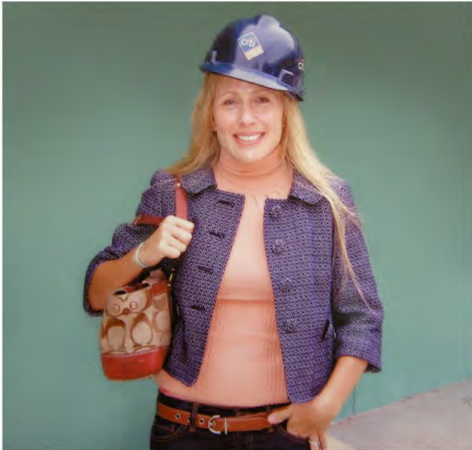
» Cardoza Plumbing works in a variety of industries throughout New York City and maintains a steady stream of work, despite a down market. The company works in a variety of industries throughout New York City.

"They receive a five-year apprenticeship, then they become journeymen, then they are