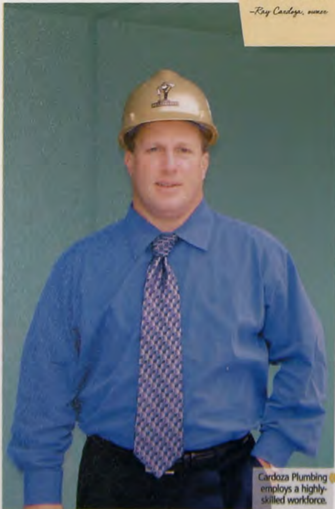
Cardoza Plumbing employs a highly-skilled workforce.