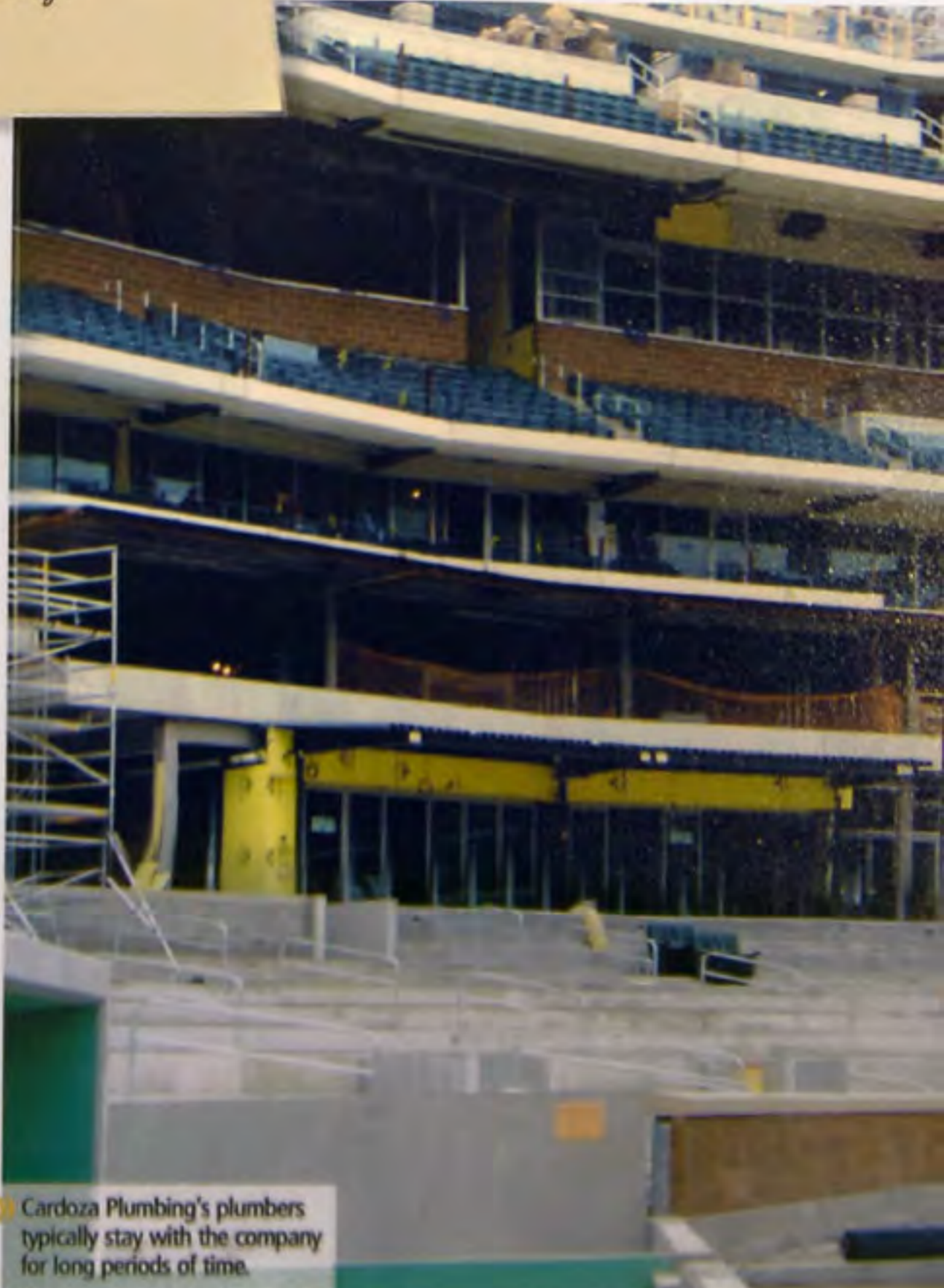
Cardoza Plumbing's plumbers typically stay with the company for long periods of time.